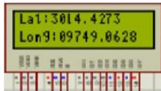
Fig.4.3. Output in LCD

IoT module will track the current location of the victim and it will update the location on the webpage. The microcontroller will switch ON the buzzer in the device, so that nearby people may come to know that someone is in danger and they will come to rescue.