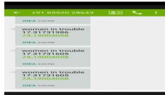
Fig.4.2. Output results.

IoT module will track the current location of the victim and it will update the location on the webpage. The microcontroller will switch ON the buzzer in the device, so that nearby people may come to know that someone is in danger and they will come to rescue.