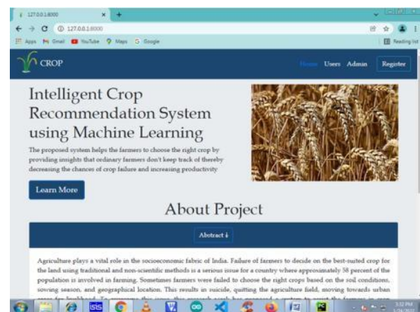
Fig.1. Home page.

Regression (LR) with pipeline, Support Vector Machine (SVM), Decision Tree (DT), Random Forest (RF). The accuracy of the classifiers was calculated using the confusion matrix. The classifier which bags up the highest accuracy could be determined as the best classifier.