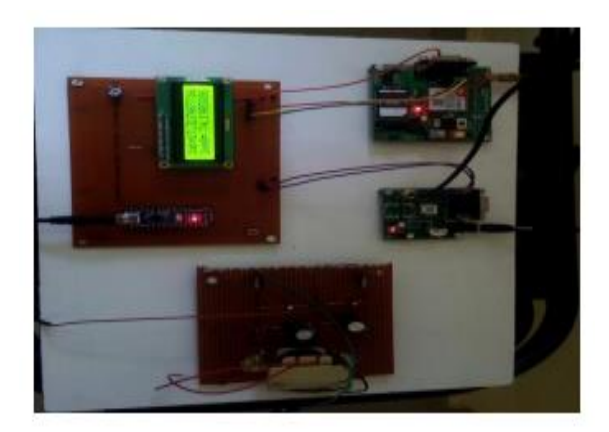
Fig.4.1. Hardware kit image.

second, shock is applied to kidnappers when metal detector detects the presence of metal. At third, message will be send to the predefined numbers using GSM and spot is being tracked using GPS. The main advantage of this system is that the user does not require a Smartphone unlike other applications that have been developed earlier. The use of sophisticated components ensures accuracy and makes it reliable. The cloves provides with all the features which will leave no stone unturned to help the victim in any kind of emergency situations.