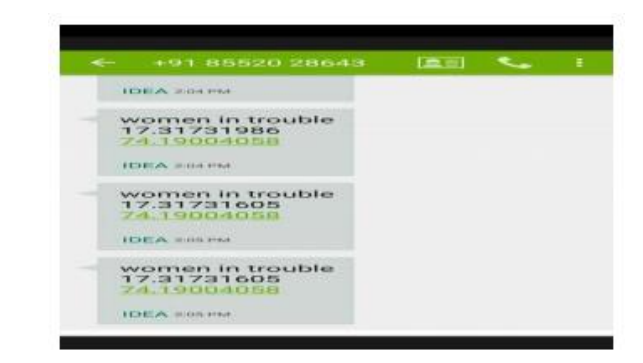
Fig.4.2. Output results.

IoT module will track the current location of the victim and it will update the location on the webpage. The microcontroller will switch ON the buzzer in the device, so that nearby people may come to know that someone is in danger and they will come to rescue.