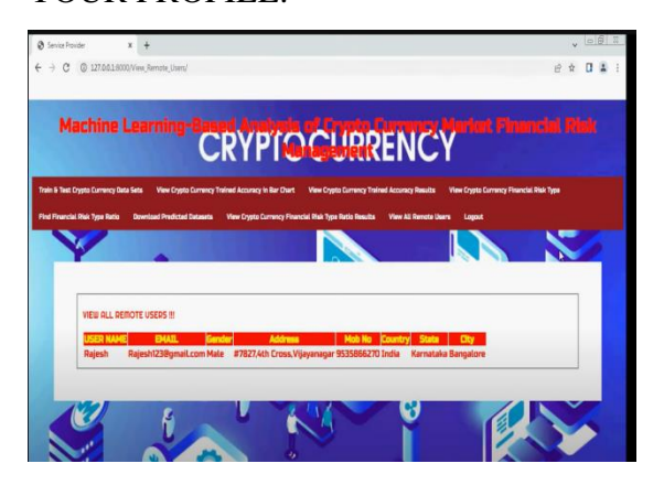
Fig.1. Home page.

successful user will do some operations like REGISTER AND LOGIN, PREDICT CRYPTO CURRENCY FINANCIAL RISK TYPE, VIEW YOUR PROFILE.