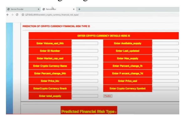
Fig.5. prediction values.