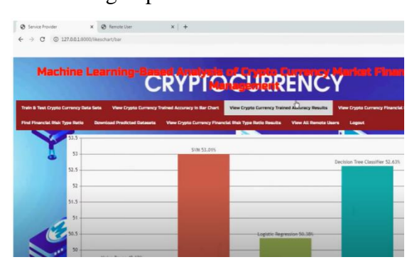
Fig.6. graph analysis.